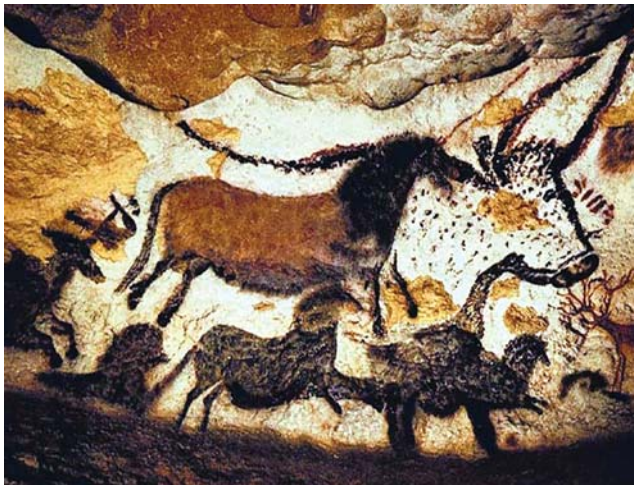
Vivid paintings are found in the caves of Lascaux in Montignac France. Fossilized skeletons were found of the same animals portrayed in these remarkable stone-age images. Some of the pictures are of now-extinct creatures, including the auroch. The cave complex was discovered in 1940, and the images date back 17,300 years.

and sure enough there was a BBC documentary filmed in Africa that began with the words: “How do mere humans, without fangs or claws, who can’t outrun a wildebeest, get a meal around here?” We saw three Dorobo tribesmen stalking prey through the African bush. “First they had to find the tracks of a pride of hunting lions,” said the BBC commentary. Eventually, we saw a large group of lions feeding from the carcass of a wildebeest. The tribesmen crept closer, and then stood up, three of them, walking straight toward the lions.