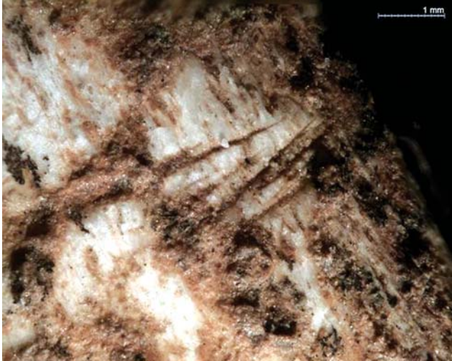
Cut marks on bones dating back 300,000 years have been found at Gran Dolina, Spain. In this instance, the microscopic traces were found on the bones of an extinct lion, showing that humans consumed carnivore meat. This does not mean that our antecedents hunted the animal — it may have been killed during a fight over food. The findings were reported by National Geographic News in 2012.