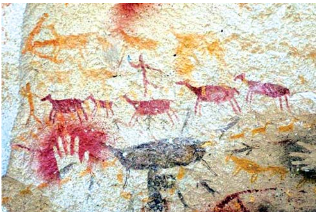
Near Santa Cruz, Argentina, lies the Cueva de Las Manos in which these remarkably evocative images have survived. These wall paintings, interspersed with more than 700 outline images of human hands, date back 9,000 years and depict cooperative hunting of wild animals.

Neolithic humans fashioned from flint and fixed to wooden staves with binders made from leather or entwined plant stems. Travel back several million years earlier and we have fossil remains of apes with sufficient physical attributes to make them brutally successful hunters. Both versions make good evolutionary sense and stand scrutiny — but we have to bridge the gap between the two.