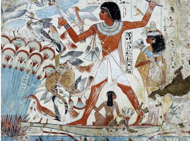
This ancient Egyptian wall painting, dating back about 3,350 years ago, shows the scribe Nebamun at the temple of Amun at Karnak with his wife Hatshepsut and their daughter hunting wildfowl in the marshes of the Nile. The tawny cat that is catching birds represents the sun god Ra, which explains why it has been finished with a gilded eye.