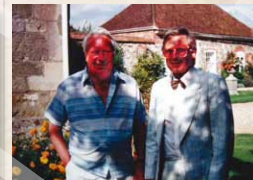
Sir Edward Heath, by contrast, had little knowledge of science. At his home in Salisbury, he showed off his grand piano with pride, though – truth to tell – he did not play it well. His garden was separated from public parkland by a narrow backwater, and he liked to stroll along the banks waving courteously to people on the opposite side and posing for photographs.