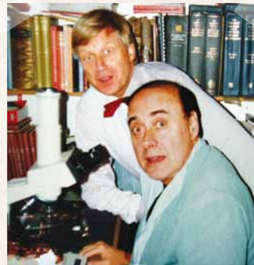
As a boy, the actor Victor Spinetti always wanted to be a microscopist but his attempts to buy an instrument were thwarted. Staying with us in rural Cambridgeshire he became transfixed by the spectacle of aquatic microorganisms living their intricate lives, and we spent half the night investigating a variety of specimens. A TV company arrived next day to film us.

in greater detail into the autonomous abilities of living cells. By the 1990s, when I wrote Genes: the Fight for Life , it was apparent to me that organisms like predatory protozoa and shell-building amoebae showed unmistakable ingenuity, and cell repair in the rhodophyte algae could reveal the roots of intelligence. I published a lengthy paper on this concept in Interdisciplinary Science Reviews and an article in New Scientist . This is now a major thread of my research after 50 years of fellowship.