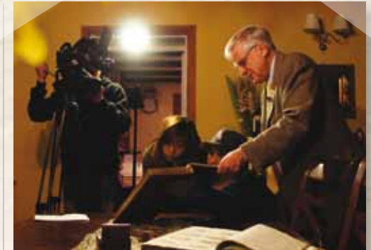
Television film makers have since come to visit us from many countries, and my research has featured on Korean national television more than once. These documentary producers from Seoul concentrated on the history of microscopy and here we are with a copy of Robert Hooke's 1665 book Micrographia from my library collection.

I have explained my ideas on foreign TV channels but living cells remain a rarity on British television; editors argue that the public are not familiar with microscopes, so there is no demand for programmes. This "Catch-22" argument is rife among producers, and the microscope is badly served by television.