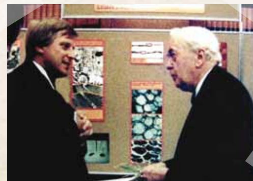
Each year the Royal Society stages an open day when they invite distinguished guests to view a selection of current research projects. In 1981 Sir Harold Wilson was particularly fascinated by the images we were taking through early microscopes, and how they could be correlated with high-resolution micrographs made with the scanning electron microscope.

In the event I found nine envelopes among the letters, all but one containing the original specimens Leeuwenhoek sent to the Society in the seventeenth century. It was a stunning revelation. They disclosed much about how that great man worked, and – after the announcement in my Royal Society paper – further publications followed in journals ranging