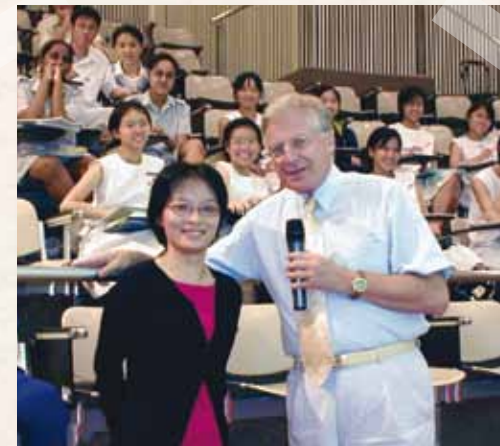
Asian audiences are particularly interested when I speak on my work with single-celled organisms. This group of students from one of my recent lectures in Singapore kept me entertained for half an hour after my lecture with penetrating and incisive questions. Their eagerness to know more about microscopes is refreshing, and I have given television interviews on the topic for Channel News Asia.

Other mysteries arose. One was why deciduous plants shed their leaves. The arguments were that the leaves would be damaged in winter, but evergreens showed that was not inevitable. Evergreens also shed their leaves (in the summer, not the fall). Water shortage provided another reason, though that did not explain why aquatic species abscised leaves. Microscopy proved that pigments were not (as the books said) 'revealed' when chlorophyll was withdrawn; one could show how materials were positively translocated into the leaves before they were shed, including heavy metals. I developed a view that this was a plant's excretory mechanism, and that abscission (of sepals, petals, etc.) was a consequence of any metabolically-active phase of a plant. The concept was widely reported, and featured on the BBC's Autumn Watch programme. I have recently been lecturing on it at Cambridge.