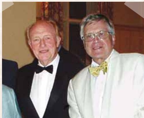
Neil Kinnock – now Baron Kinnock of Bedwelty – was a contemporary of mine at Cardiff University in the early 1960s. We renewed our acquaintance when Neil was appointed President of Council at the university, where I am a Fellow and a member of the University Court. His successor is Sir Martin Evans, who won a Nobel Prize for his work on stem cells.

Cardiff University has always been an important part of my life. I was honoured to be elected a Fellow and a member of the University Court, positions that I still hold. I was President of the Association of Past Students for several years, and I owe my University friends so much. I have known all the Vice-Chancellors, and was particularly pleased