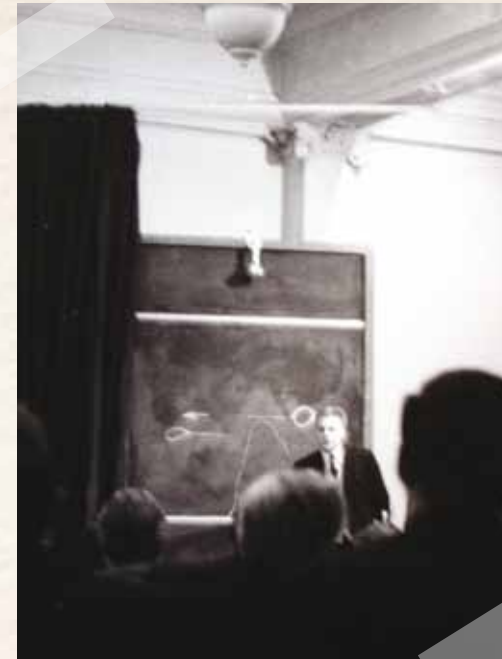
Photographed from the audience, this was the first lecture on my microscopical research in London and took place at Burlington House, Piccadilly, in the Royal Society's lecture room. It was 1965 and the subject of my illustrated presentation was human blood coagulation. The mechanism of erythrocyte capture is shown on the board.

they could, like an arrow shot from a bow, connect across the wound. I showed that erythrocytes attached themselves to threads like balloons on strings, and this was how occlusion of a damaged vessel came about. At the age of 25 I was given a slot to present this research in the lecture room of the Royal Society. The micrographs won awards, and the research was widely discussed in the press. The London Evening Standard described the results as 'sensational', and it featured on the front page of Medical News .