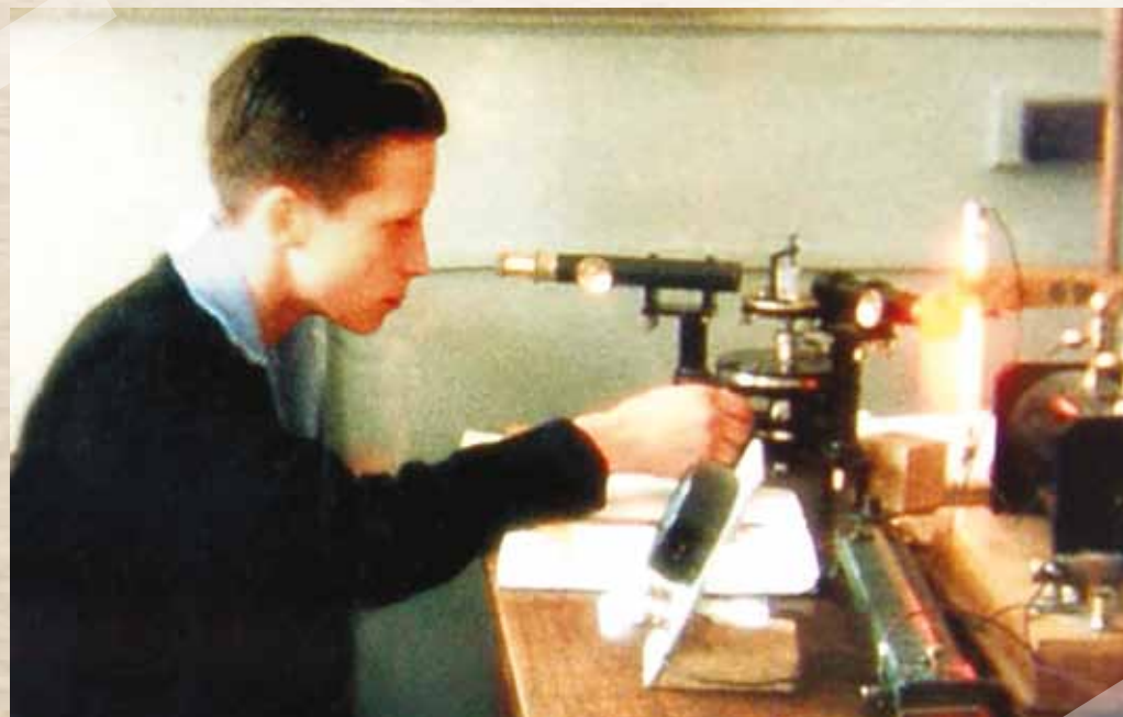
Optical instruments were always an attraction to this teenaged schoolboy, and the revelations made possible by a spectrometer had a particular appeal. Microscopes quickly became a major preoccupation from the age of twelve, and capturing micrographs of elusive images was soon to become an enduring fascination.